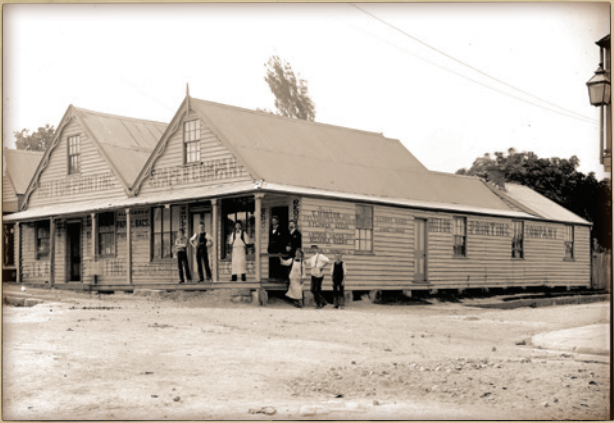
Hutton's Printing and Paper Company, 1897