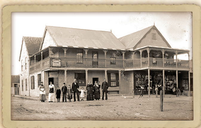
Gold Miners' Home Hotel

The Commercial Hotel (Snake Gully) operated from the corner of Elder and Grainger streets from 1880 to 2018. A complex containing shops on ground level and residential units above is planned for the site.