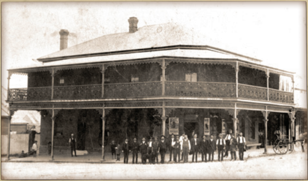
Northumberland Hotel Newcastle Region Library

The only hotel still trading is the Northumberland Hotel. It started trading in 1866 and continues to trade from its original site, under its original name. The current hotel was built around 1930.