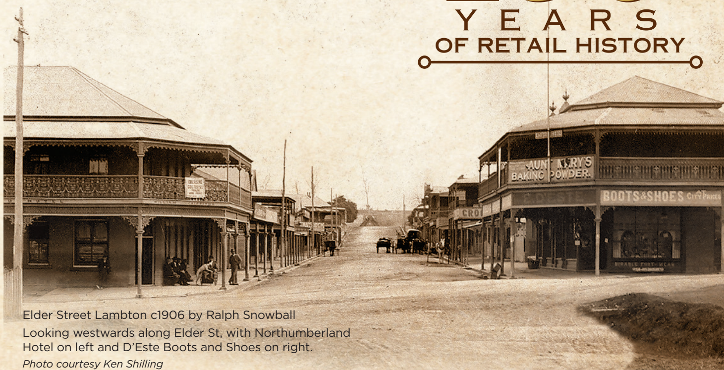
Elder Street Lambton c1906 by Ralph Snowball Looking westwards along Elder St, with Northumberland Hotel on left and D'Este Boots and Shoes on right. Photo courtesy Ken Shilling

ELDER STREET LAMBTON Celebrating 150 YEARS OF RETAIL HISTORY