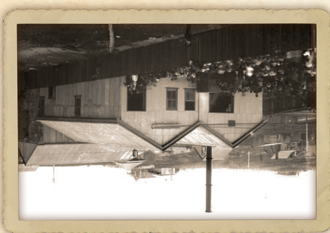
Crowd at Lambton Electric Light Station, 1890

The oldest church building in Lambton is the Bethel Congregational Church. It was built in 1868 from stone transported from a quarry in High Street to Dickson Street. The parishioners worked in the mine during the day and after completing their shift went to work on the church. The first minister was Rev Evan Lewis who opened a drapery store in Elder Street around 1867.