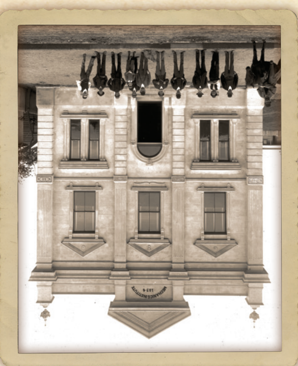
Mechanics' and Miners' Institute, Elder Street 1898

Lambton Municipality was proclaimed in 1871 and the first council meeting was held in the Mechanics' Institute. Then located in Howe Street, part of this original structure is now sitting at the back of the Mechanics' Institute, built 1894 opposite the park.