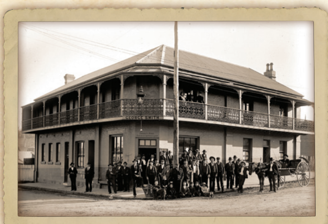
George Smith's Commercial Hotel

The Commercial Hotel (Snake Gully) operated from the corner of Elder and Grainger streets from 1880 to 2018. A complex containing shops on ground level and residential units above is planned for the site.