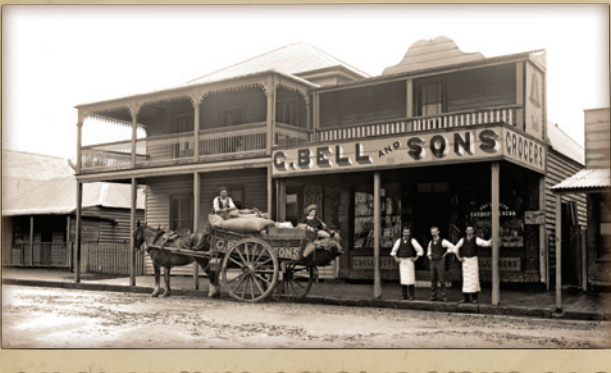
G Bell & Sons, 1896

The grocery and drapery business managed by the Bell Family traded for 80 years. G Bell & Sons opened in 1881 and the family residence was built on the western side of the shop.